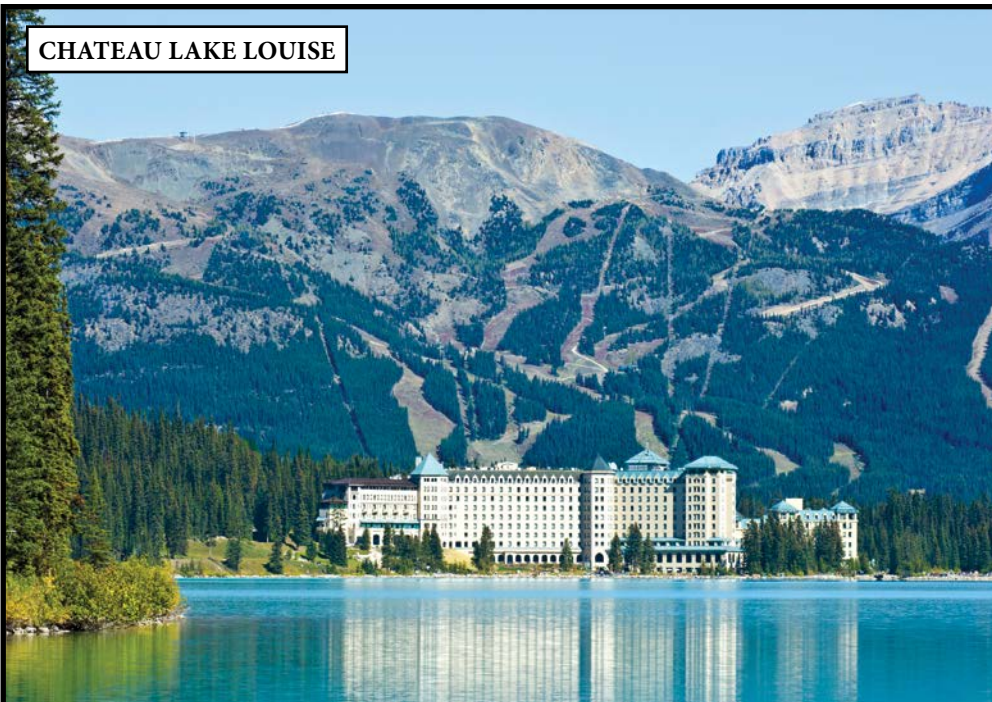
CHATEAU LAKE LOUISE

This morning we'll travel to nearby Maligne Lake and embark on a scenic cruise. This afternoon we'll board our motorcoach and travel west through the Yellowhead Pass about 50 miles to enjoy more of the spectacular Canadian Rockies scenery. We'll view Mt. Robson, the highest peak in the Canadian Rockies at 12,972 feet. We'll return to Jasper for a second night.