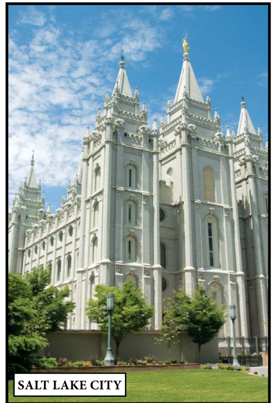
SALT LAKE CITY

We will view the Canyon from several observation areas. A knowledgeable guide will accompany our group and provide exceptional information on the Grand Canyon and its environs. Our first stop will be Watchtower