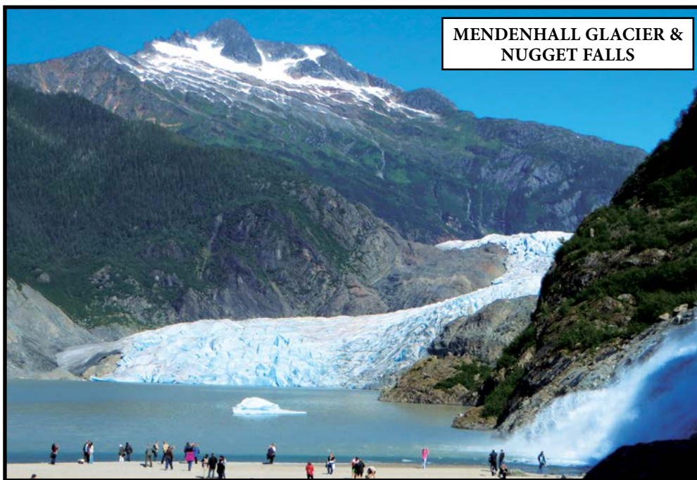
MENDENHALL GLACIER & NUGGET FALLS

With stunning views of island-dotted waters and majestic spruce forests that reach the water, many consider Sitka to be Alaska's most beautiful seaside