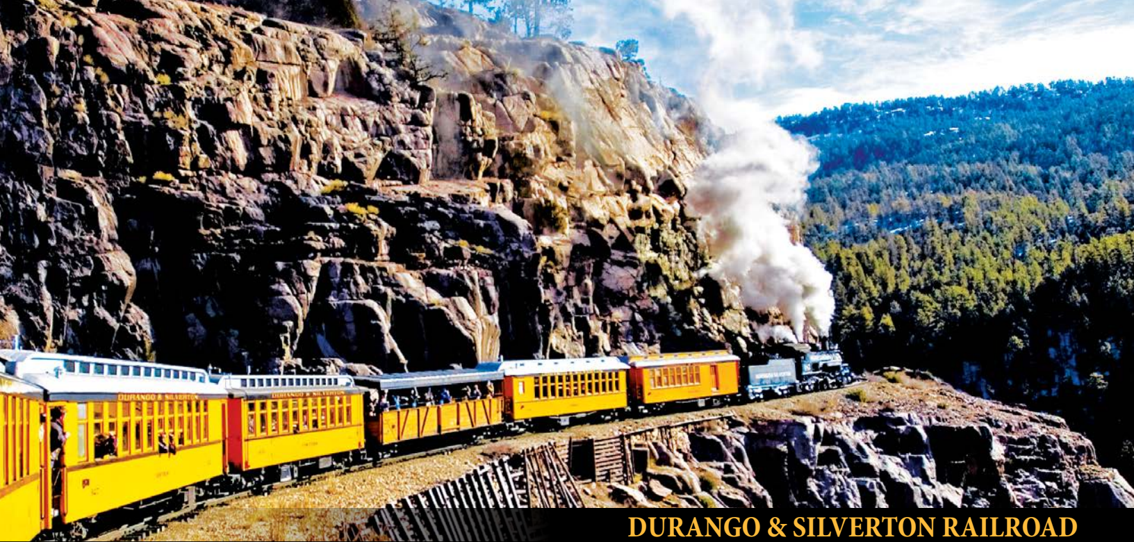
DURANGO & SILVERTON RAILROAD