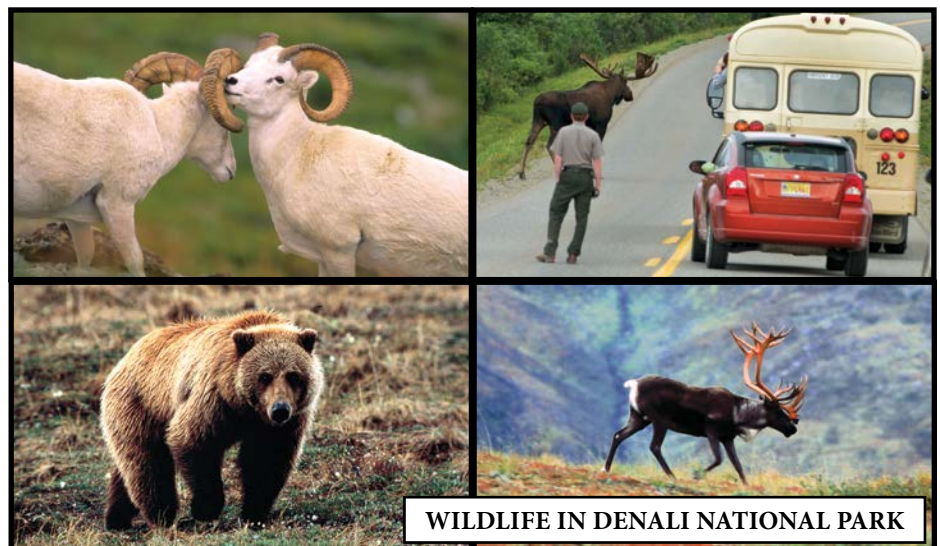
WILDLIFE IN DENALI NATIONAL PARK

Denali National Park is six million acres of wild land, bisected by one ribbon of road. This afternoon we'll embark on a 5 - 7 hour Tundra Wilderness Tour traveling 53 miles into the park. Spectacular scenery, a narrated history of the park and some of the best opportunities to view wildlife await. Have your camera ready as September is prime time for seeing fox, Dall sheep, moose, caribou, wolves and grizzly bears.