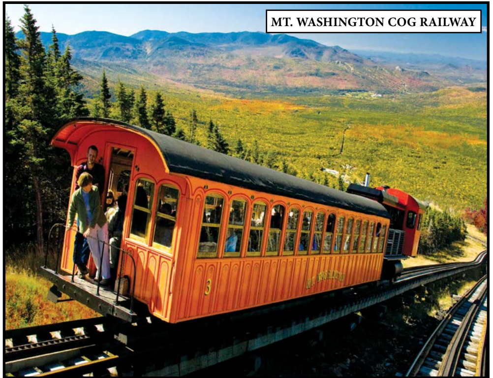
MT. WASHINGTON COG RAILWAY

Relax in your comfortable coach seat. Arrival into New York Penn Station is scheduled for 12:45 p.m.