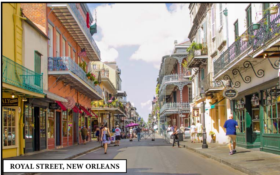
ROYAL STREET, NEW ORLEANS