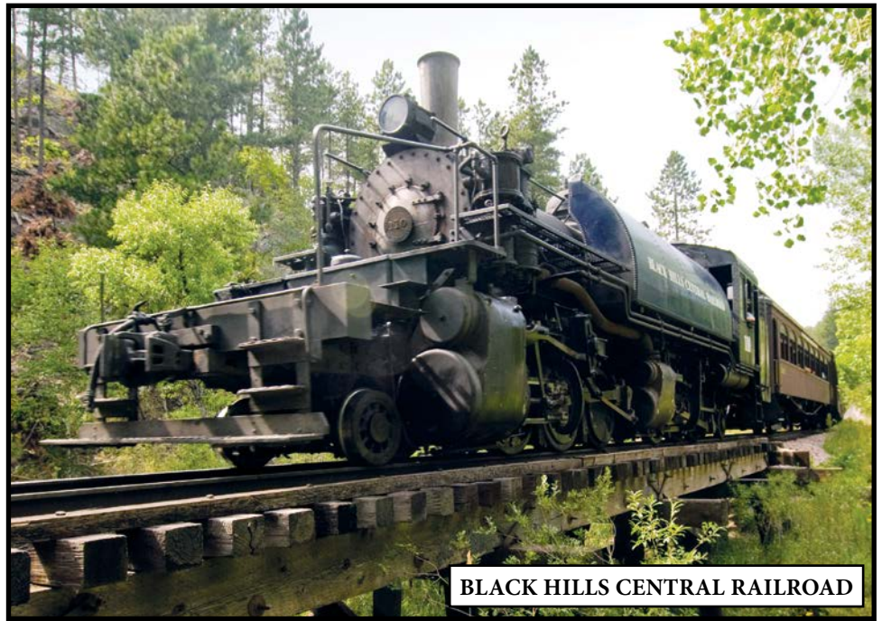
BLACK HILLS CENTRAL RAILROAD

Following a Continental breakfast we will spend the morning at the Buffalo Bill Historic Center, which has five museums in one easy-to-navigate location. Museums at the site include the Buffalo Bill Museum, exploring the famous life of "Buffalo Bill" Cody, the Whitney Gallery of Western Art, the Cody Firearms Museum and the Draper Museum of Natural History. The Plains Indian Museum features art and artifacts of the Plains Indians, including the Arapaho, Crow, Cheyenne, Kiowa, Comanche, Blackfeet, Sioux, Gros Ventre, Shoshone and Pawnee. At noon we will depart for Rapid City, South Dakota. We will make a stop for an included dinner in Gillette, Wyoming, at the Prime Rib Restaurant. We'll spend the next three nights at the Hilton Garden Inn. CB