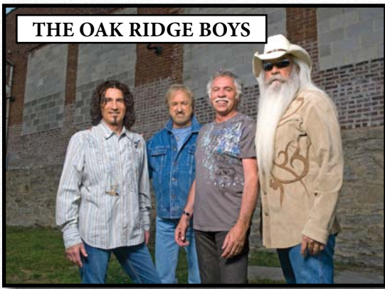
THE OAK RIDGE BOYS

physical performance art. Featuring spectacular backdrops, beautiful costuming, and state-of-the-art lighting this show is a thrill a minute! The show combines extraordinary and inventive feats of strength and skill, control and balance.