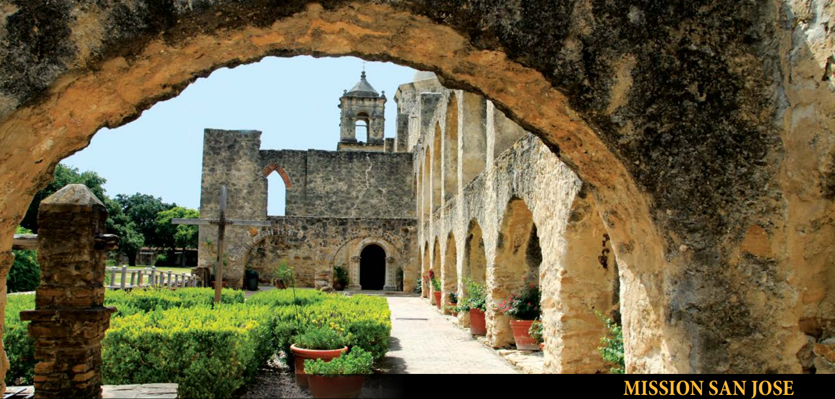
MISSION SAN JOSE